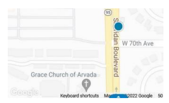
Bus 72 (Westbound) W. 72<sup>nd</sup> Ave & Sheridan Blvd .32 miles

Bus 51 (Northbound) W. 70th Ave & Sheridan Blvd (East Side) .09 miles